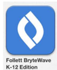
Follett BryteWave K-12 Edition

To Checkout eBooks through Destiny Discover: